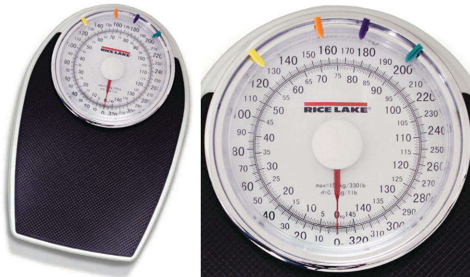
Figure 1. Scale Model RL-330HHD

Warranty information is available at www.ricelake.com/warranties